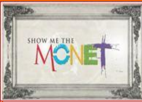
Logo prop of Lucky Day Productions