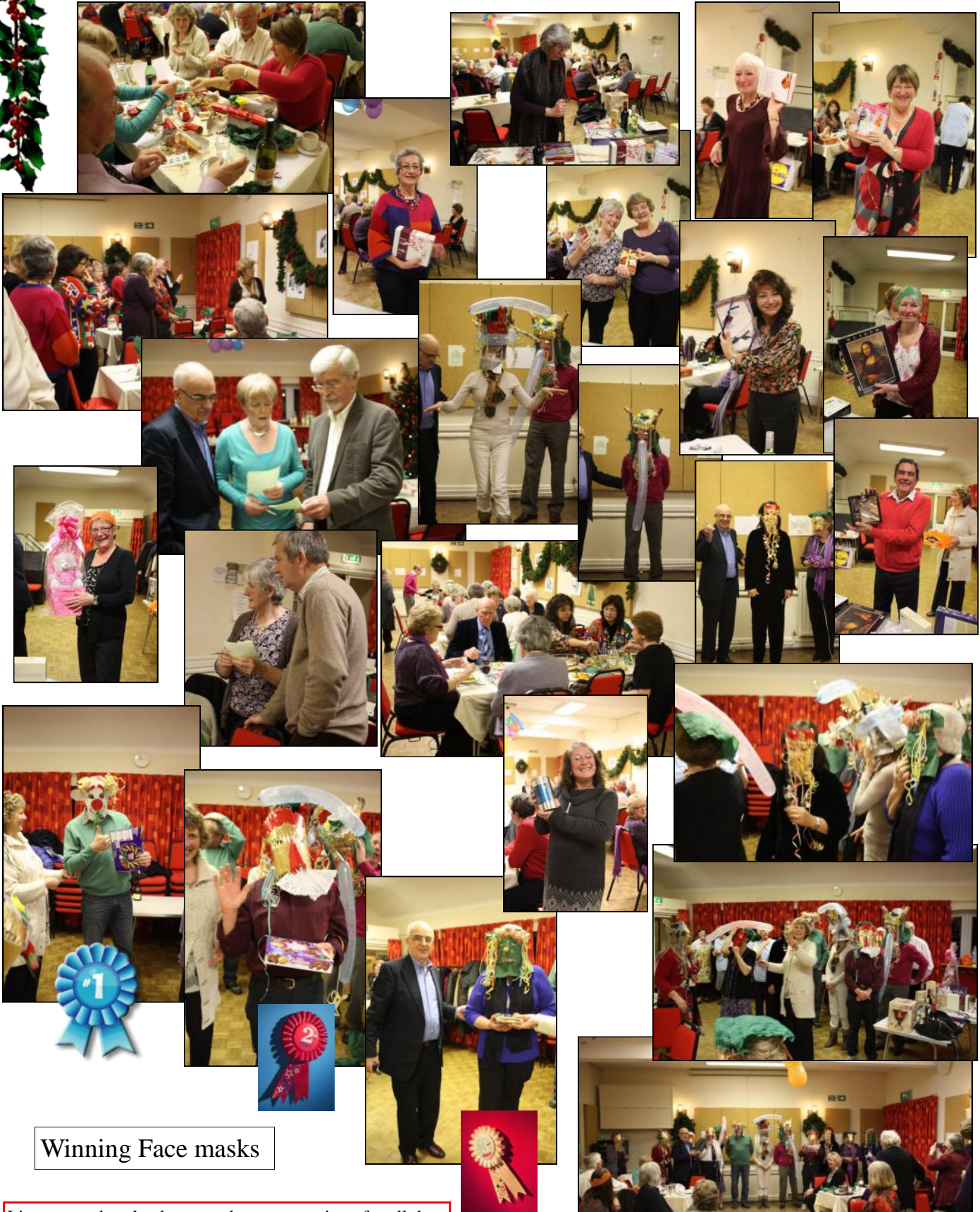
Winning Face masks